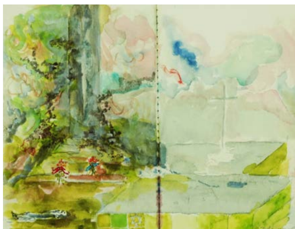
Zbylitowska Góra. Painting by Natasha Doyon. Watercolor on archival paper, 8x11 in, 2019

Fresh flowers... Some people must still remain if they are placing fresh flowers.