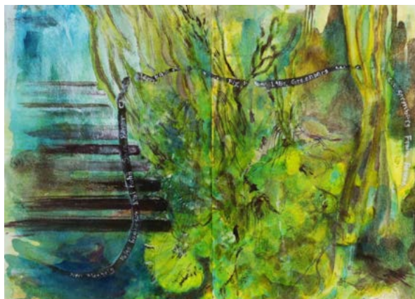
Ribbon of Remembrance – Treblinka II. Painting by Natasha Doyon. Watercolor on archival paper, 11x8 in, 2019

Scattered light purple wildflowers and grass push through the cracks in-between the stones, mirroring the restlessness of memories. Time lapses here, with one foot in the past and one marking my path through the stones I instinctually search for an echo, to hold onto something tangible. I hold onto silence and walk away more perplexed. What are the future challenges of remembrance in these sites that are conditionally ephemeral and vulnerable to the seasons? Not to mention the current whitewashing and rewriting of history, these sacred sites demand protection.