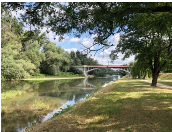
The Sola River.

Needless to say, my expectations for finding answers to questions of authenticity were rather low as I stood on the banks of the Sola River a few weeks later, playing the same Notorious track on repeat and questioning the realness of my own life experiences. I couldn't escape the feeling of being trapped between the often violent contradictions which arise when trying to define when the distance from a standard of historical-cultural experience warrants or defies authenticity. I was plagued by the question of how authenticity could be transformed into something that is capable of defense against external violences, such as appropriation or attempts to represent a given culture based on discriminatory ideologies, while simultaneously remaining open to dialogue as well as to the plurality created by differences in space, time, and the uniqueness of individual experiences.