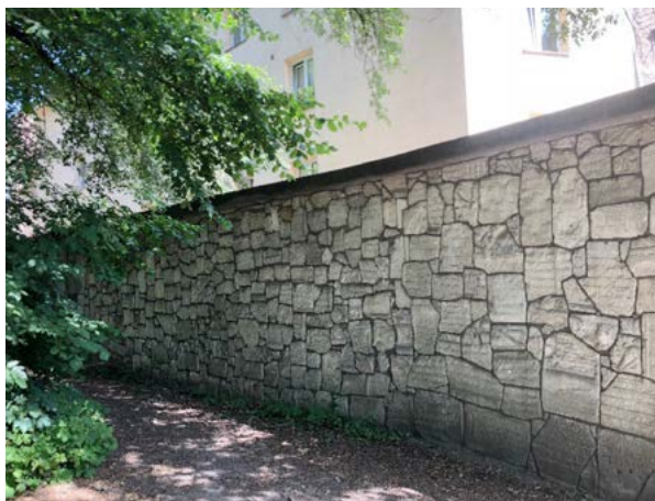
A Wall of Recovered Jewish Gravestones at the Cemetery of the Remuh Synagogue in Kraków.

the past, and to achieve collective healing between Jewish and non-Jewish individuals from all over the world. 4