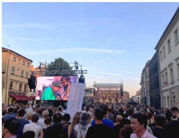
The Final Concert of the Krakow Jewish Festival.

Trying to find a starting point for discussing my interactions with authenticity in Poland has been somewhat impossible, given that questions of cultural and historical authenticity manifested themselves in almost every case study related to the remembrance, memorialization, and politicization of Jewish Polish history. One of the earliest and most fraught topics was the annual Krakow Jewish Festival, which attracts repeated accusations of creating "virtual," that is inauthentic Jewishness. These accusations are usually based on the presence of kitschy, stereotypical depictions of Jewishness and Jewish culture on the sidelines of the festival, and the fact that the majority of individuals who participate are either non-Jewish Poles or tourists from abroad. The consumption of a given culture by an extra-cultural population is always a cause for careful consideration, but if there is almost no representative population living within the same space and time, debates on what should be consumed and how become extremely fraught. 3