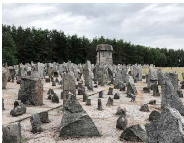
Treblinka Memorial.