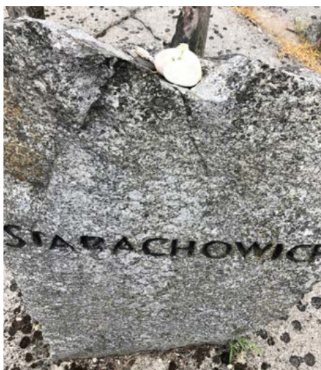
Starachowice stone.