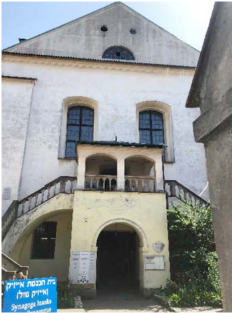
The Isaac Synagogue in Krakow.

Needless to say, my expectations for finding answers to questions of authenticity were rather low as I stood on the banks of the Sola River a few weeks later, playing the same Notorious track on repeat and questioning the realness of my own life experiences. I couldn't escape the feeling of being trapped between the often violent contradictions which arise when trying to define when the distance from a standard of historical-cultural experience warrants or defies authenticity. I was plagued by the question of how authenticity could be transformed into something that is capable of defense against external violences, such as appropriation or attempts to represent a given culture based on discriminatory ideologies, while simultaneously remaining open to dialogue as well as to the plurality created by differences in space, time, and the uniqueness of individual experiences.